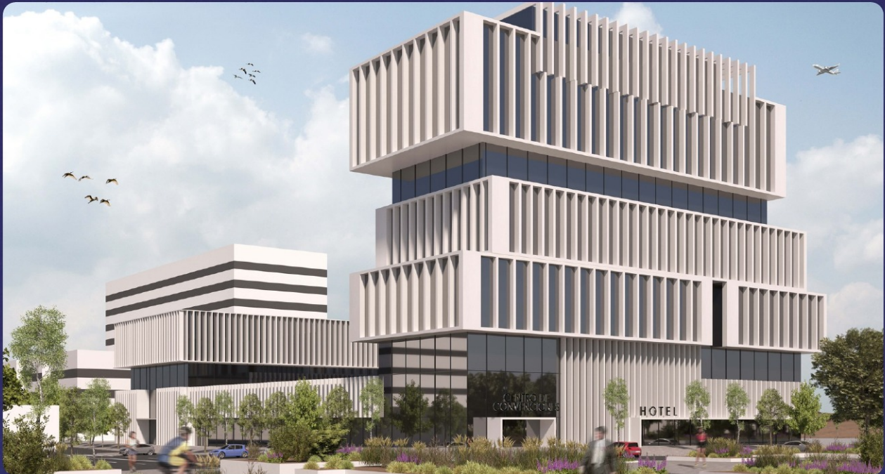
Image based on an initial project; it may be subject to modifications for technical or legal reasons and at the discretion of the project management.

C. José Antonio Fernández Ordóñez 55, Hortaleza, 28055, Madrid.